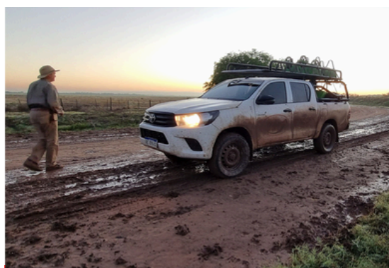
WE'RE OUT ON THE FIELD!

We cover hundreds of kilometers on dirt roads, reaching remote areas and overlooked communities.