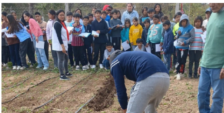
WE GENERATE REAL OPPORTUNITIES