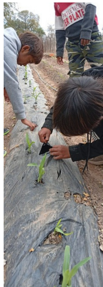
THE CHILDREN PLANT HOPE